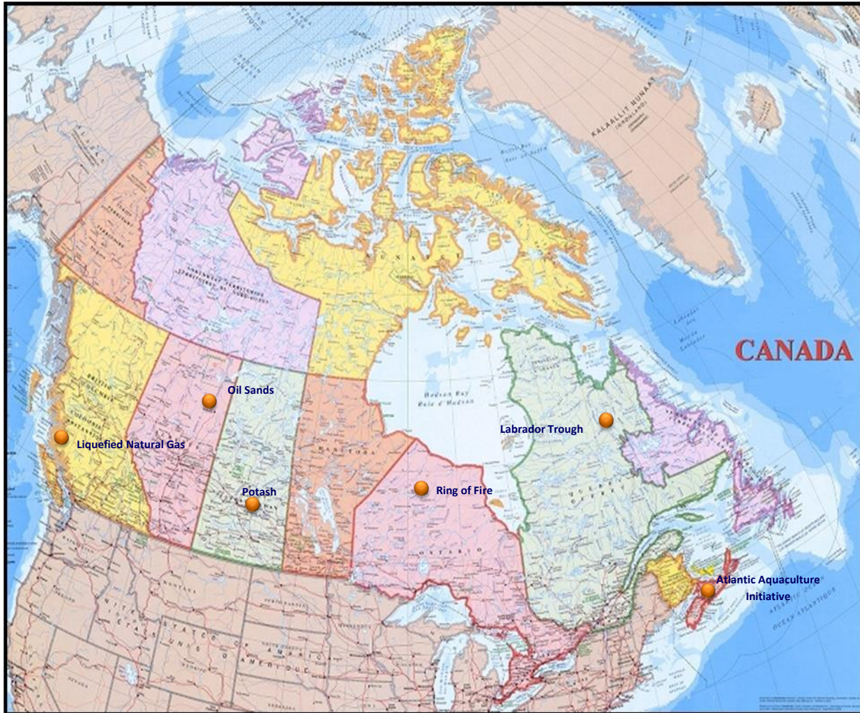
Figure 2 – Select Resource Opportunities Involving Aboriginal Groups

Not all Aboriginal communities are able to benefit from the services of the FNFMB and the other institutions under the First Nations Fiscal Management Act . Self-governing First Nations, First Nations with comprehensive land claim agreements – such as those across the territories – and Métis and Inuit communities cannot, at present, easily access the regime without significant legislative or regulatory amendments. These Aboriginal groups own, control, or have interests in land with some of the most extensive mineral and hydrocarbon deposits in Canada (Figure 3).