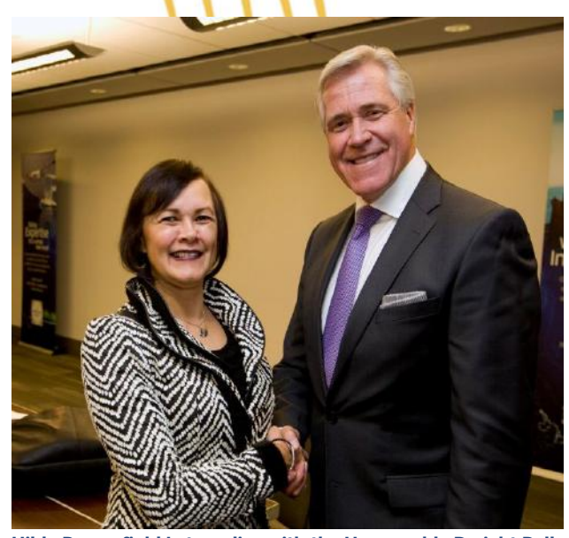
Hilda Broomfield Letemplier with the Honourable Dwight Ball, Premier of Newfoundland and Labrador

Increased spending on infrastructure can't come soon enough for Northern and Indigenous communities, where infrastructure endowment is among the poorest in country. The lack of adequate infrastructure in the North – including port facilities, runways, roads, bridges, telecommunications, housing and energy infrastructure – creates what is arguably the most significant barrier to community and economic development in the region. In 2015, the Board took a closer look at Northern infrastructure in order to develop strategies and recommendations that can begin to close the gap and facilitate Northerners access to increase economic opportunities.