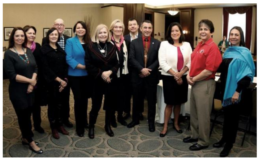
The NAEDB with Minister Bennett, Minister Tootoo, and Minister Wilson-Raybould

The full Board was pleased to meet with Ministers Carolyn Bennett, Jody Wilson-Raybould, and Hunter Tootoo